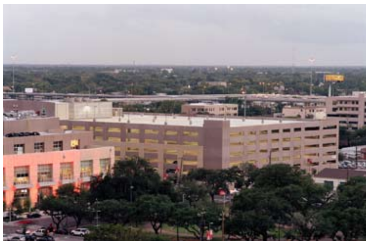
TOYOTA CENTER GARAGE, HOUSTON, TEXAS