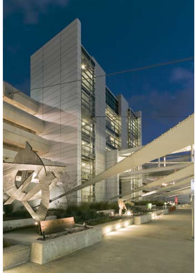
DFW TERMINAL D AND GARAGE, DFW, TEXAS

The reality is that parking garages can be people places, predictably efficient, hassle-free and even pleasant. A non-event.