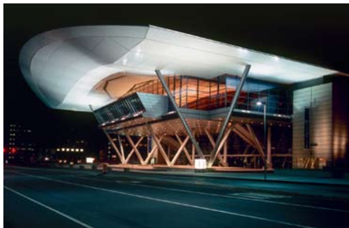
BOSTON CONVENTION AND EXHIBITION CENTER BOSTON, MASSACHUSETTS