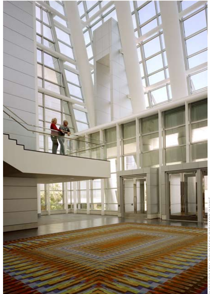
CORPUS CHRISTI CONVENTION CENTER CORPUS CHRISTI, TEXAS

We have also collaborated with some of the world's finest architects on several highly acclaimed performance halls. While their scale and purpose are vastly different, both convention centers and performance halls do one thing very well: attract a crowd. We see big value in that.