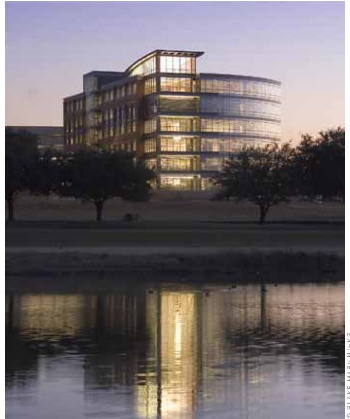
RADIOSHACK CORPORATE HEADQUARTERS FORT WORTH, TEXAS

The outcome is high-performance buildings and settings that are healthy, use our resources conscientiously and are environmentally responsible.