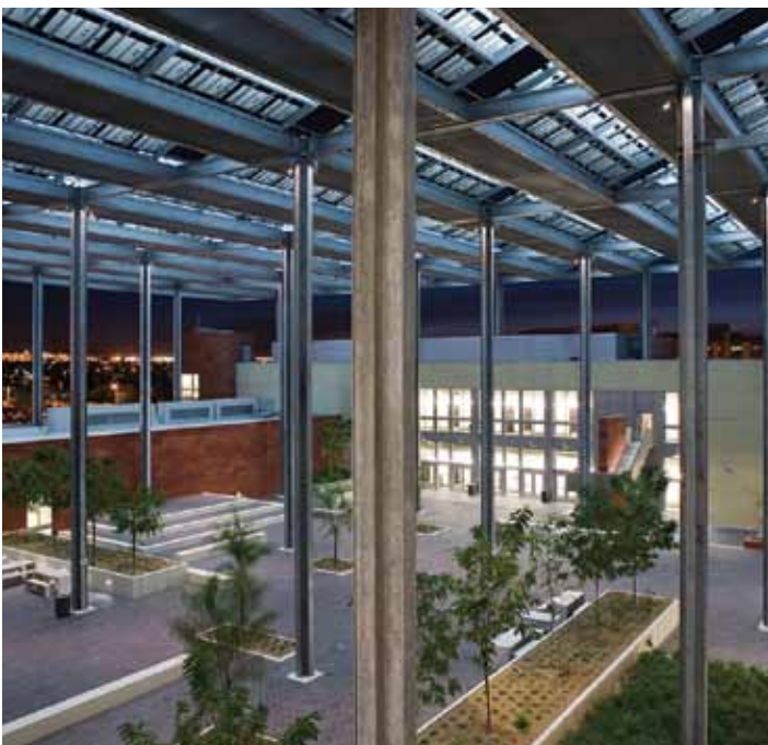
LV GREENSPUN COLLEGE OF URBAN AFFAIRS UNIVERSITY OF NEVADA, LAS VEGAS, NEVADA