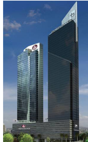
Financial Centre & Renaissance Tower