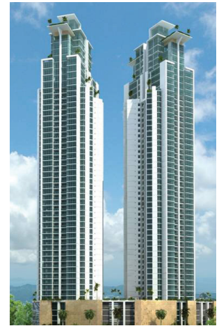
County Club Twin Towers