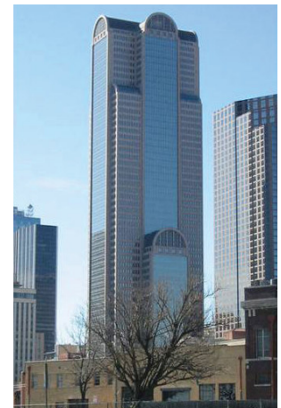
Comerica Bank Tower