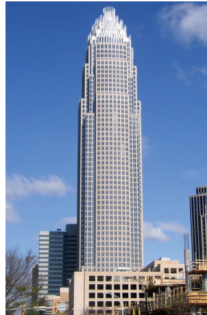
Bank of America Corporate Center